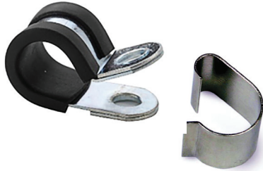
FIGURE 3: SENSOR MOUNTING CLAMP AND CLIP